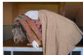
Ghost Before Editing

I had a vision for this picture that was actually very different from how it ended up here. I've learned to accept this the more I've taken pictures. Go into a shoot with ideas, but don't be afraid if it doesn't turn out the way you had envisioned. As you can see in the original photos, I actually had a person that was mourning this girl's death. However, as I was editing, the woman didn't give the impact I wanted, so I edited her out of the picture.