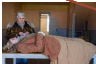
Girl Before Editing